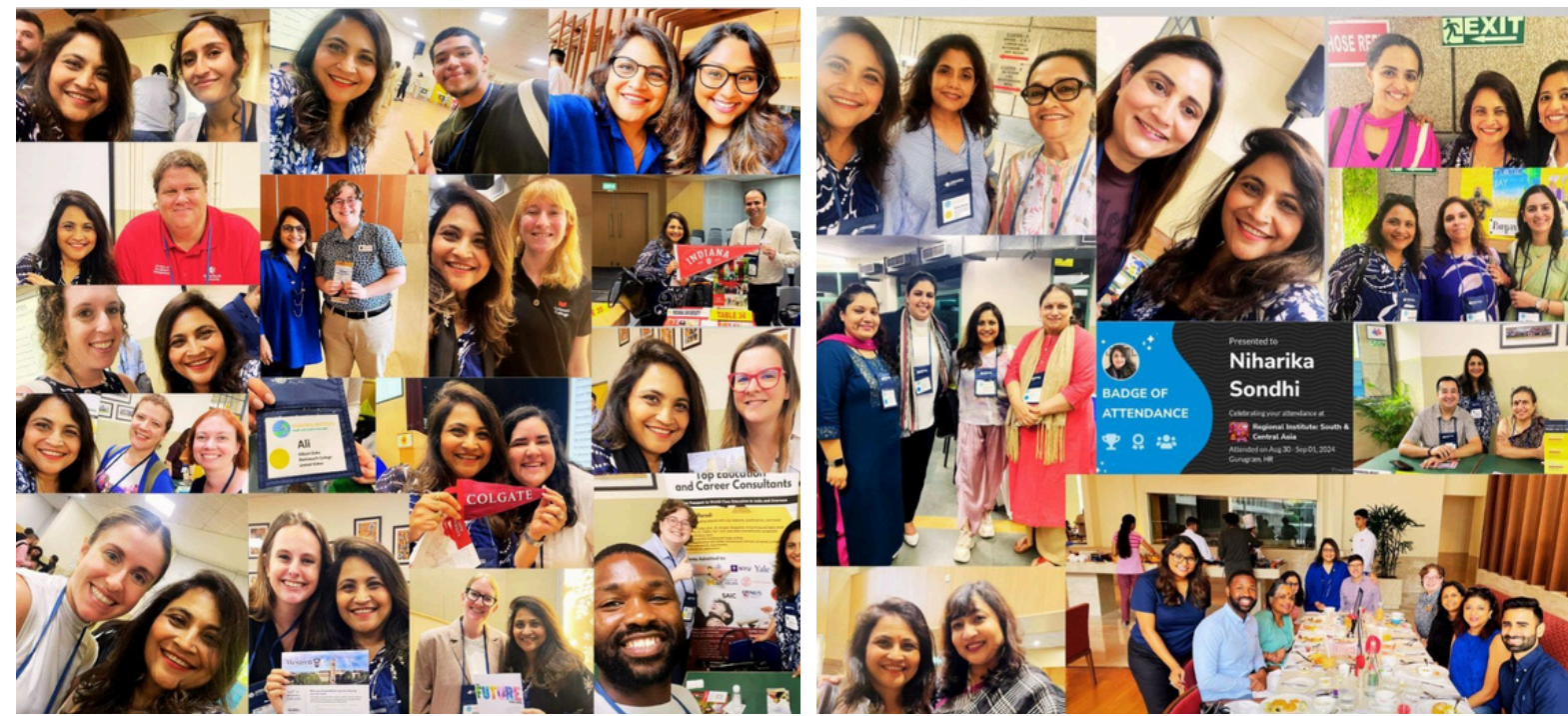
With Admission Officers from Across the Globe